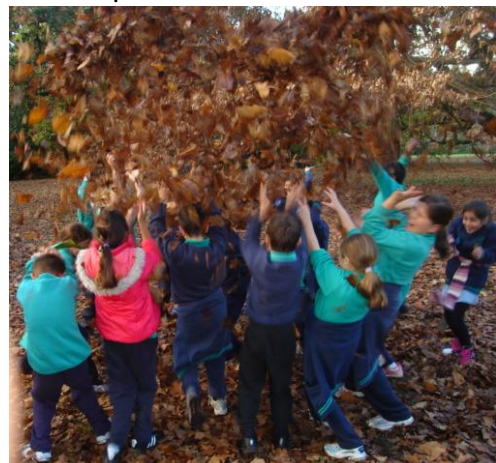
Middle students enjoying their time at the Botanical Gardens.