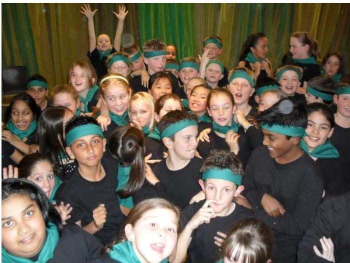
Westside Arts performers get ready to go on stage