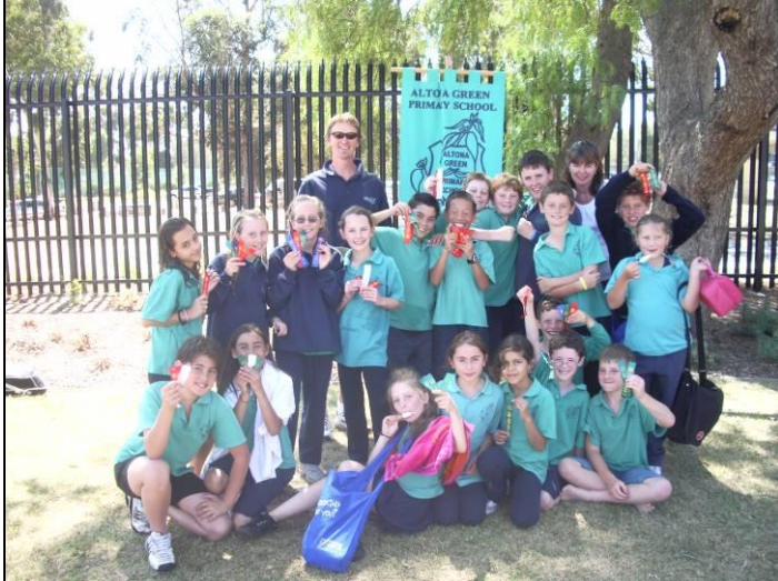
Interschool Swim Team 2009

Well done to the 19 students who were part of our Interschool Swimming team for 2009. The team competed on Monday at Werribee Outdoor Pool against other school in the Laverton Primary School Sports Association (LPSSA). Altona Green came 3 rd in the small schools competition. We are still waiting confirmation on any students who will compete in the next round.